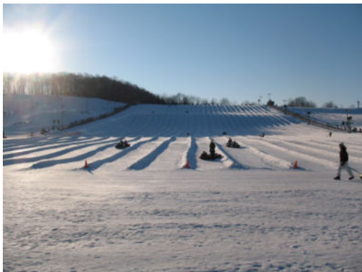
HS Youth Group trip to Sunburst