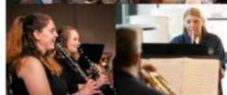
Lakeland University Chamber Winds