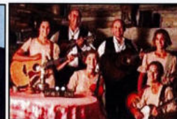
Heartland Harmony Charles City, IA