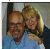
The Formans Fulton, MO