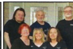
Damascus Road Marion, IA