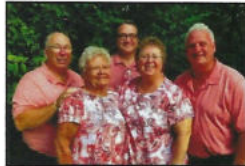
Voices of Peace Potter, WI