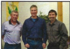
NorthWoods Gospel Friends Rhineland, WI