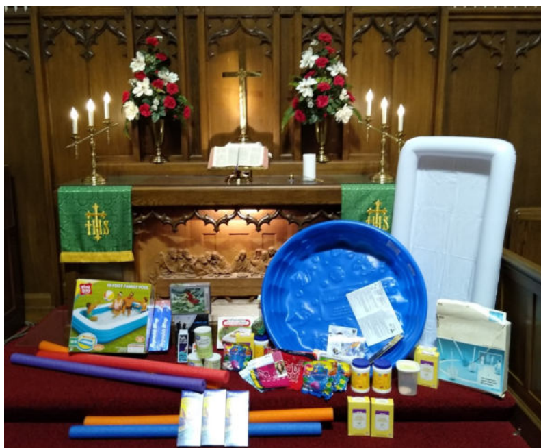
VBS Generosity Gifts at the Altar

ST. JAMES UCC 13312 Pioneer Road Newton, WI 53063 920.693.8100