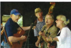
Banjoy North English, IA