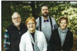
Loynachans Winterset, IA