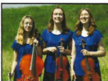
Spirited Strings Kaukauna, WI