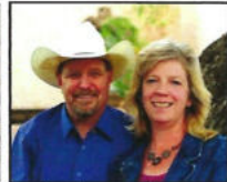
Ambassadors of Grace Thompson, MO