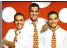
3 Heath Brothers Thomasville, NC