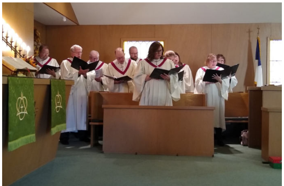
St. James Choir

St. Mark's choir practice will be held on Wednesdays, Dec. 1st, 8th, 15th & 22nd beginning at 7:00pm.