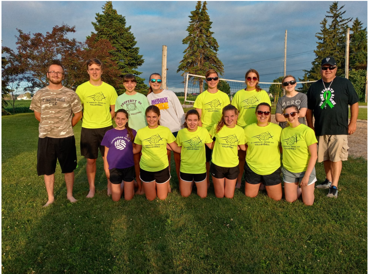
St. James/St. Mark's Youth Volleyball Team~2021