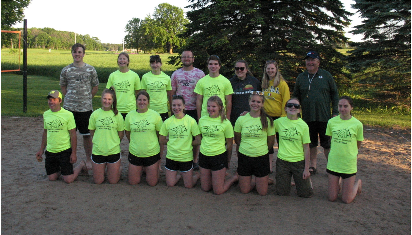
St. James/St. Mark's Youth Volleyball Team June 12, 2022-first game of the season!