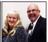
The Formans Fulton, MO