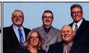
Common Bond Quartet Raceville, KY