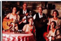
Heartland Harmony Charles City, IA