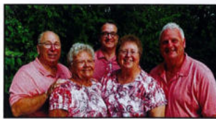
Voices of Peace Potter, WI