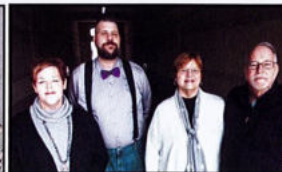
Loynachans Winterset, IA