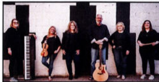
SaltLight Waverly, IA