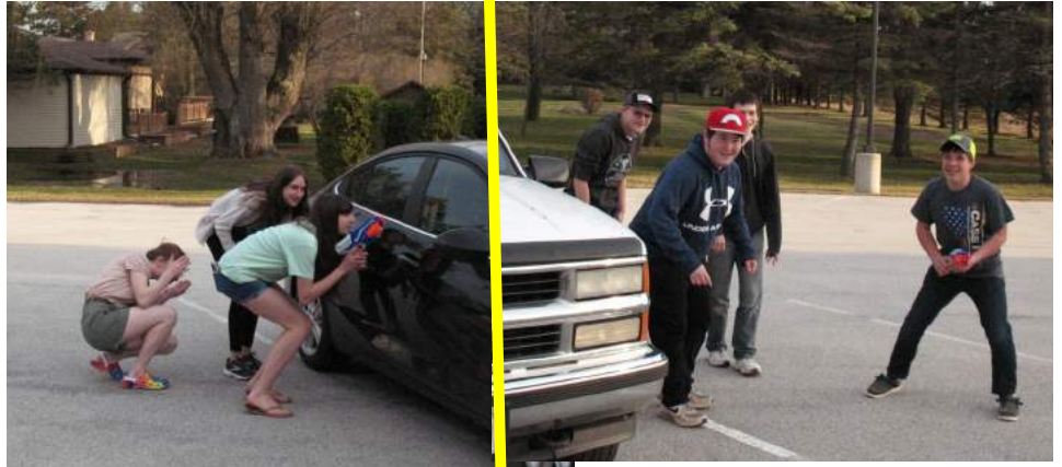
Nerf Battle :)