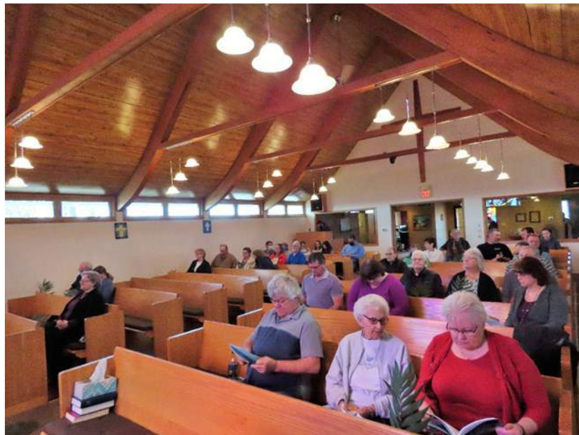
The Congregation of Washington Reformation on Palm Sunday

Learn more about the Wisconsin Conference at wcucc.org