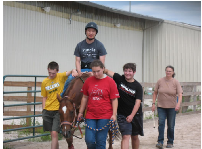
Our outing with the horses was at Reins, Inc., an equine therapy business, offering equine therapy to a range of children and adults with special needs.